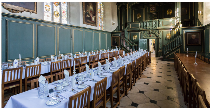
The Magdalene Hall

A beautiful 16th century dining room where students have the opportunity to celebrate their last evening on the programme. Students dine by candlelight below the stunning stained glass windows.